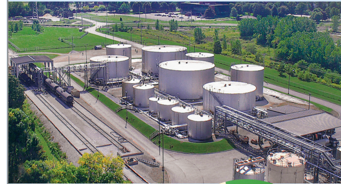
The Hero BX Facility in Erie, Pennsylvania