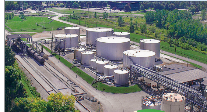
The Hero BX Facility in Erie, Pennsylvania